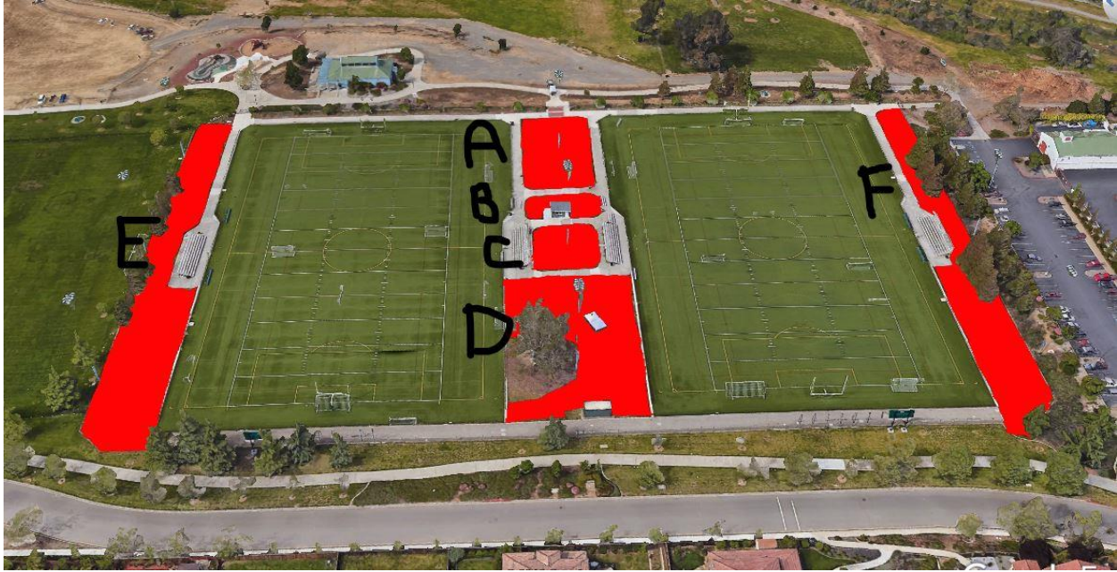
Exhibit A – View of Robertson Park Fields and Plans for Synthetic Turf Installation

The synthetic turf will be installed in areas A, B, C and D.