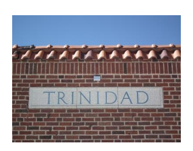
Examples of signage that are characteristic of the Corazon de Trinidad Historic District