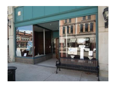
Examples of storefronts and entry areas in the Corazon de Trinidad Historic District