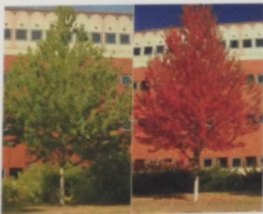
RED SUNSET MAPLE