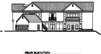
Project: 971 Spring Street - Site Plan Review 06-01-E - Toad Hall