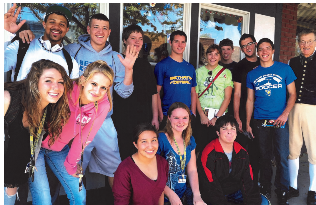
A group of students enjoy one of Lindsborg's finest walking tours. Highlights on the tour include learning about coffee at Blacksmith Coffee Rostery and hearing the stories behind the Dala Horse at the Hemslojd, Inc. Call 785-227-8687 to ask about booking a tour today.

Christmas in Lindsborg is a very special tradition. The CVB invites everyone to become involved in the traditions and celebrate with one of the greatest cities in Kansas!