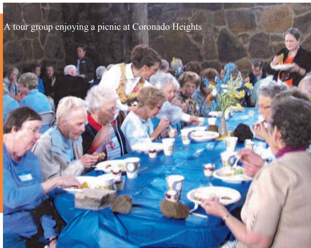
A tour group enjoying a picnic at Coronado Heights

Also, we cannot express enough gratitude to all the business and organizations of Lindsborg who pitch in tirelessly with their time, fantastic character and donations! The friendliness and the time spent to make Lindsborg a "Destination for All Seasons," is because of each of you. The appreciation we have is boundless.