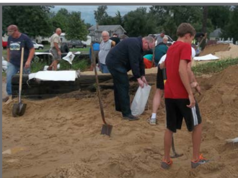
Volunteers help fill sandbags. It was great to see everyone pitch in and help!